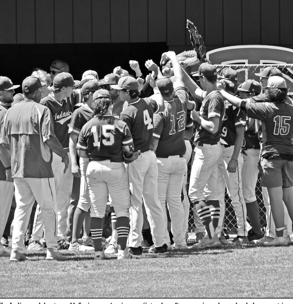
The Indians celebrate an 11-5 win over Aquinas on Saturday after escaping a bases-loaded, one-out jam courtesy of a game-ending double play.

Chauncey scored during a put up a 5-spot in the bottom punching out five. Offensively, 1-for-4 game; Cunningham walked and scored a run during a 1-for-2 performance; Kirby finished 2 for 3.